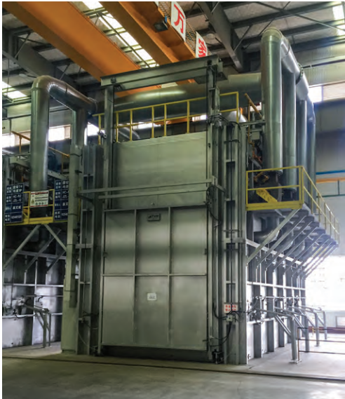
Fig. 5. 30-ton gas-fired homogenizing furnace