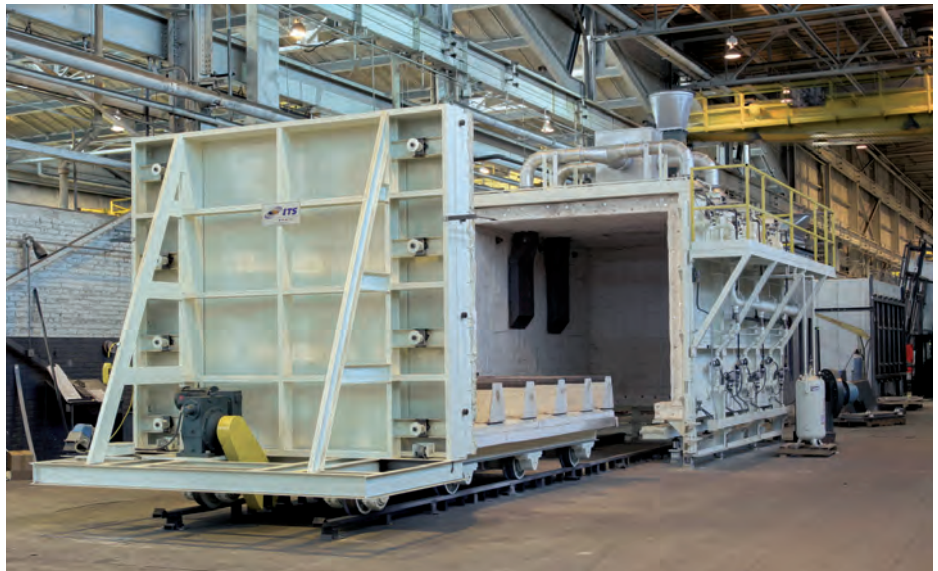
Fig. 4. Car-bottom furnace for homogenizing and stress relieving

surveyed with air thermocouples, but the temperature uniformity that can be achieved with production loads,” Schmauch said. “The requirements by the specification to meet excellent temperature control with an air-couple survey is not sufficient. The accuracy of the furnace must be established with the types of loads used in production, which requires building loads that represent production loads and then using that load configuration during homogenization of production metal. If the production group decides they need to change the load configurations, then the furnace needs to be recertified with the new load configuration as well.”