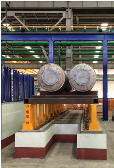
Fig. 3. Charge station of round-ingot homogenizing furnace line