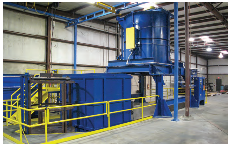
Fig. 2. Seven-foot-diameter drop-bottom aluminum solution heat-treat system with glycol quench

"The important feature here is not the ability of the homogenization furnace to hold a very close tolerance when