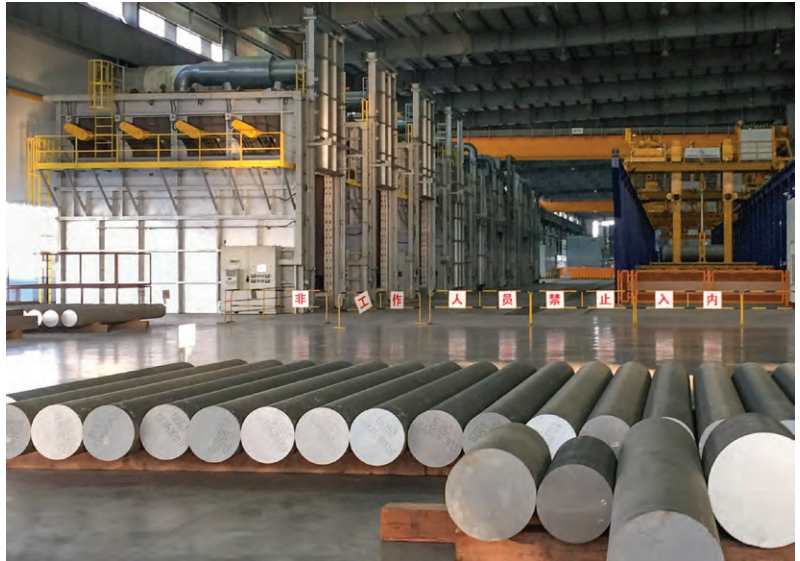
Fig. 6. Eight-furnace homogenizing line with cooler and charge car

to meet the requirements for uniformity. In addition, many times the most difficult problem to solve with these types of furnaces is the heat-treatment rate and consistency between parts. Without the proper air-recirculation system, parts on different levels or in different baskets can experience significant differences in their heat-treatment cycles, requiring extended processing times with varying metallurgical results. In many cases, even though all parts may meet the metallurgical requirements, end users are becoming extremely critical of time/temperature curves with large discrepancies between parts.