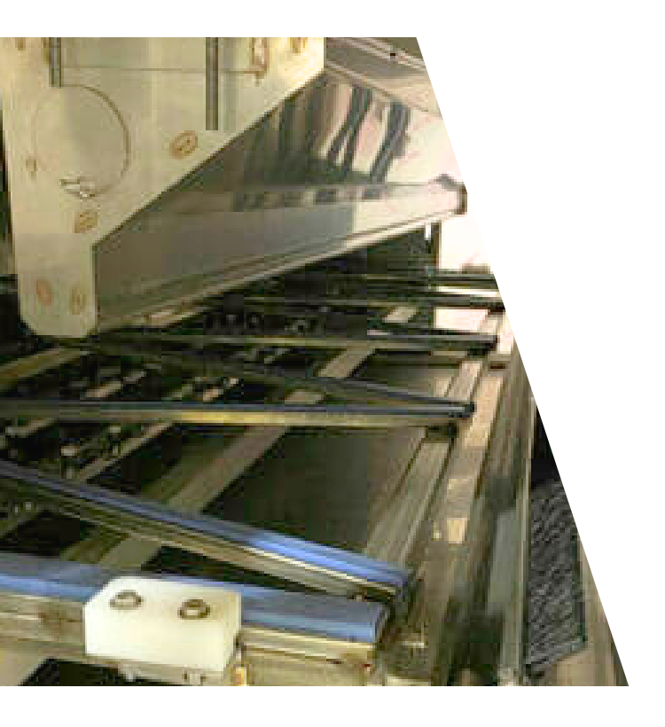
Turn-key installation completed in as little as 1 week

The Slide Bed package utilizes a proprietary plastic resin bed that will significantly reduce maintenance, improve performance, and reduce energy costs.